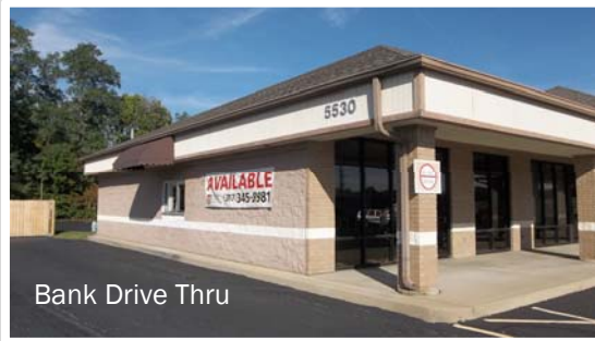
Bank Drive Thru

ONE UNIT AVAILABLE: Former Bank Space with Drive-Thru End Cap Suite 240 with 2,294 SF