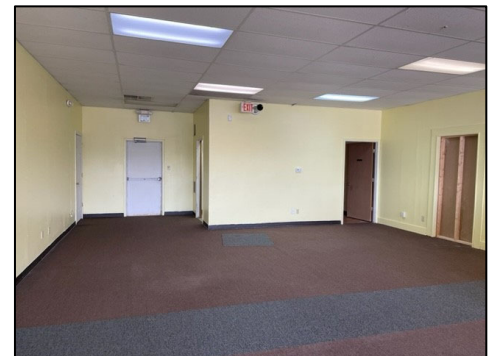
Suite 866 1,200 Square Feet Rate: $14.00/SF/YR Type: NNN