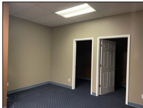
Suite 890 1,600 Square Feet Rate: $16.00/SF/YR Type: NNN