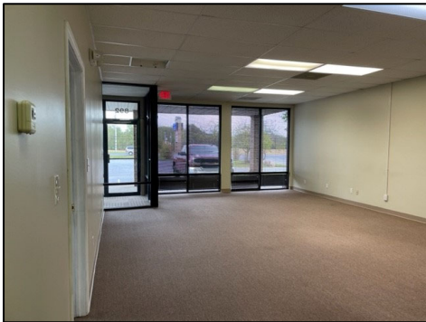
Suite 892 1,600 Square Feet Rate: $16.00/SF/YR Type: NNN